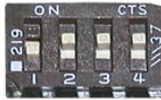
Mode Switch Setting for Doubling the Sensitivity

However, if you need more sensitivity, set Switch 1 OFF and leave the others ON. This will effectively increase mouse speed by a factor of two.