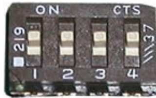
Default Mode Switch Settings

If you change a mode switch unplug/plug the HeadMouse – this tells HeadMouse to read the mode switches. The factory default mode switch positions are all ON.