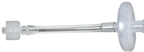
Figure 3 In-Line filter protects the Sip/Puff Switch internal components from moisture. This filter cannot not be cleaned.

The pneumatic connector should not be over tightened.