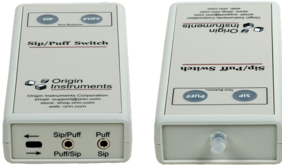
Figure 1: Sip and puff electrical connections on the left and pneumatic connector on the right.

Two cables are included with the Sip/Puff Switch. Connect a stereo cable to the center connector if both sip and puff closures are communicated to the controlled device using one cable.